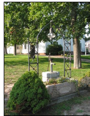
Water pump on Old Main St.

Based on the information gathered from these sources, as well as from the Town of Yarmouth Comprehensive Plan, the CPC developed a list of goals and priorities for the specific target areas, which are listed below. Some of these projects are ready for immediate action while others will be acted on in the future.