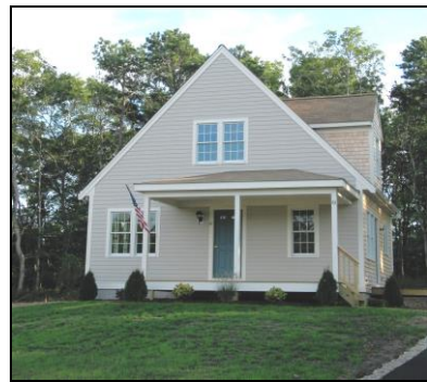
Brush Hill Road Project

As of December 2020, the Town of Yarmouth, has 602 units of affordable housing that contribute to the Town's affordable housing stock as determined by the Massachusetts Department of Housing and Community Development (DHCD). Accordingly, if we compare the existing affordable housing stock to that required by the State, Yarmouth is "short" by approximately 602 units.