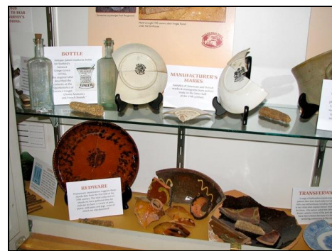
Historic Artifacts Discovered at Taylor Bray Farm