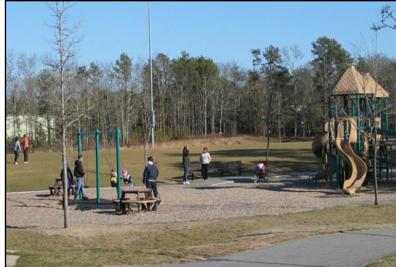
Peter Homer Park on Old Town House Road

We intend to increase our ability to meet the recreational needs of the growing community by establishing long-range planning, rehabilitating decaying infrastructure at the parks and beaches, developing dormant parcels previously purchased for active recreation use, as well as restoring and expanding present facilities. Potential projects of interest are expanding bicycle trails within town and connecting the bicycle trail to adjacent towns; enhancing the Cape Cod Pathways, a county-wide network of linked walking trails from one end of Cape Cod to another; and expanding recreational options at Town recreational sites.